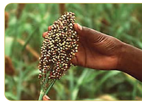
Sorghum grown in Namibia

SADC CSC in conjunction with other partners will continue to closely monitor the status of evolution of El-Niño and updates will be issued from time to time. \square