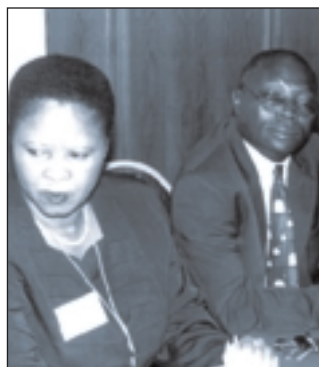
Community building 13