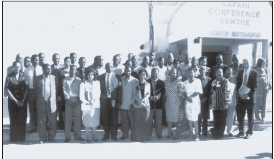
SADC media coordinators seen here with participants from the region at a media workshop in Windhoek, Namibia. The media is considered a key partner in communicating SADC objectives and programmes.

The committees, which are chaired by the SADC National Contact Points, are expected to set up technical committees to deal