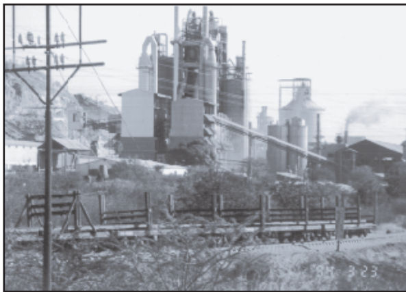
Efficient industries are needed to produce regionally competitive products

A dispute settlement mechanism was adopted as part of the amendment protocol of 2000. The mechanism provides for complaints by member states in terms of implementing the Trade Protocol against another member state to be lodged with the Trade Implementation Unit, now under the TIFI Directorate, which would facilitate the resolution of such disputes through consultations, good offices and panel of experts. The ruling by the panel of experts once adopted by the Committee of Ministers of Trade is final. Disputing member states are expected to imple-