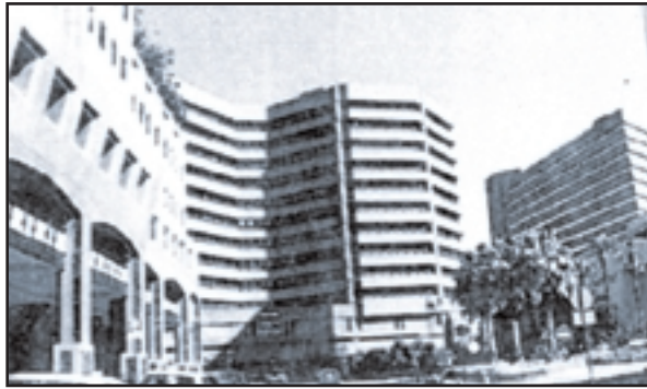
Sandton: Financial hub of South Africa. SADC has policies for cooperation in finance and investment.

Despite the negative impact of poor seasons and HIV/AIDS, there are some countries that have recorded consistent growth rates, well above the target seven percent. The fast growing economies are Botswana and Mozambique, which respectively