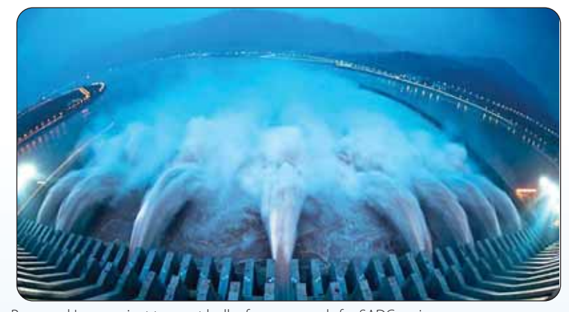
with the DRC in realising Proposed Inga project to meet bulk of power needs for SADC region

Five other hydropower plants are expected to be built on the