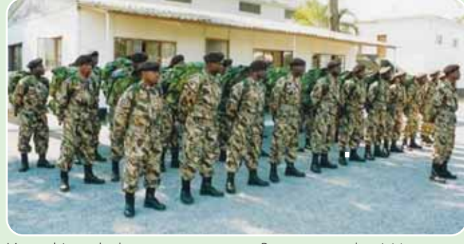
Mozambique deploys troops to counter Renamo armed activities

"The joint Summit strongly condemned the recent acts of