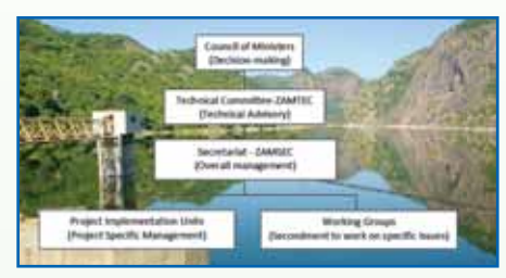
ZAMCOM Governance Structure

the ZAMCOM Agreement, that it is ready to accede to the agreement. The Malawian cabinet is reportedly also considering to accede to the agreement. The Zambezi ┌