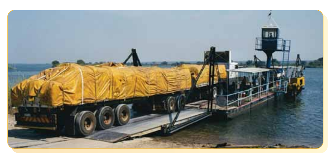
A pontoon ferry across the Zambezi River between Botswana and Zambia

Construction of the bridge is largely being funded by cooperating partners such as Japan International Cooperation Agency and the African Development Bank. However, Botswana and Zambia are required to contribute some funds towards construction.