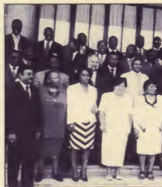
SADC Summit 8