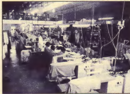
SADC textiles could soon find a market in Japan.

Addressing the exhibition which opened on 15 October, former Japanese Prime Minister, Yoshiro Mori said the exhibition was a landmark activity aimed at promoting and strengthening relations between Japan and the SADC member states. He said this was part of Japan's global diplomacy strategy of focusing on African issues. Mori expressed optimism that the exhibition would result in an