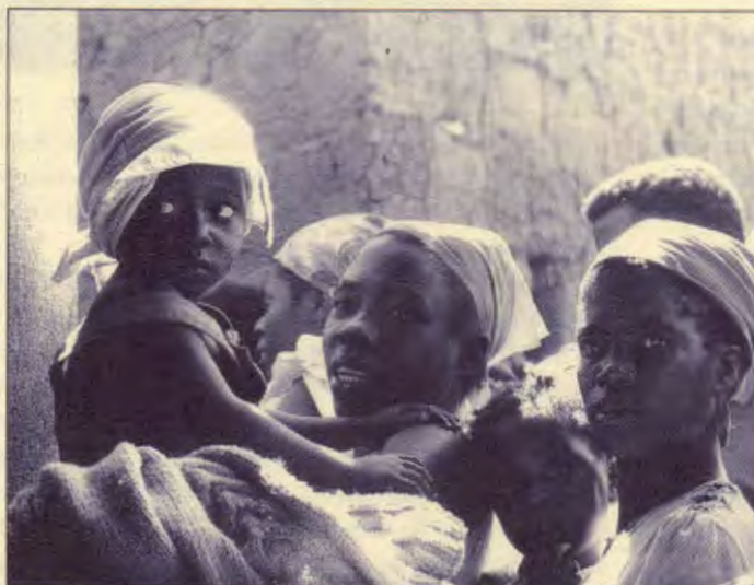
Angolan women queue for immunization.

According to the UNHCR, 35,000 refugees reside at Meheba; 24,000 at Nangweshi camp, 700 km west of Lusaka, and another 20,000 at Mayukwayukwa Settlement in Kaoma, 320 km west of Lusaka.