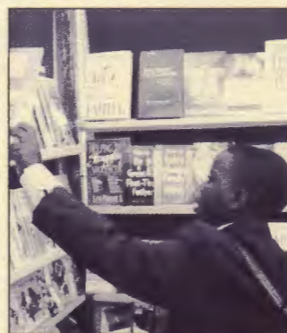
Community building 11