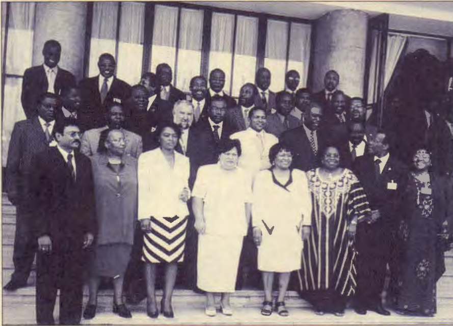
Council of Ministers with the SADC Executive Secretary (front row extreme left), in Luanda

Following are excerpts from the communiqué released after the 2002 SADC Summit held in Luanda, Angola, from 2-3 October.