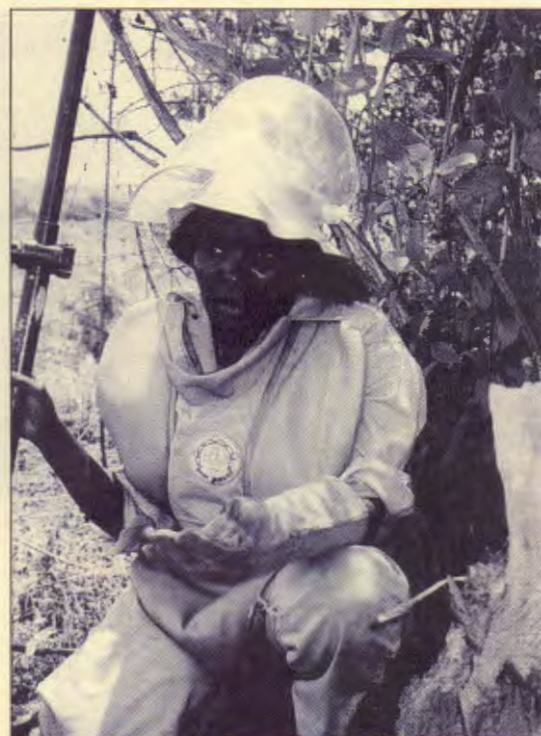
A deminer clearing landmines in Angola.