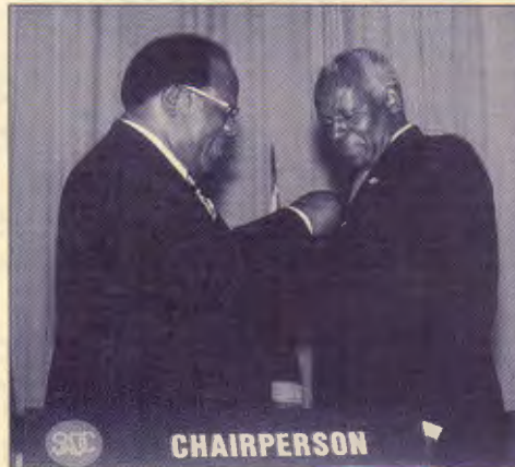
Presidents Muluzi and Dos Santos during the ceremonial handover of the SADC chair.

The Summit also noted with satisfaction latest developments in the resolution of conflict in the DRC, which has so far claimed three million lives. Peace is fast returning to the vast African country following the signing of agreements between government and some of the rebel movements and their backers, Rwanda and Uganda. Foreign troops are in the process of