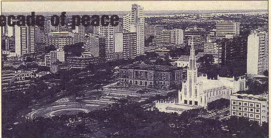
Maputo has fully benefited from the peace dividend.

Dhlakama said that, now that political independence and peace had been achieved, Mozambique should strive