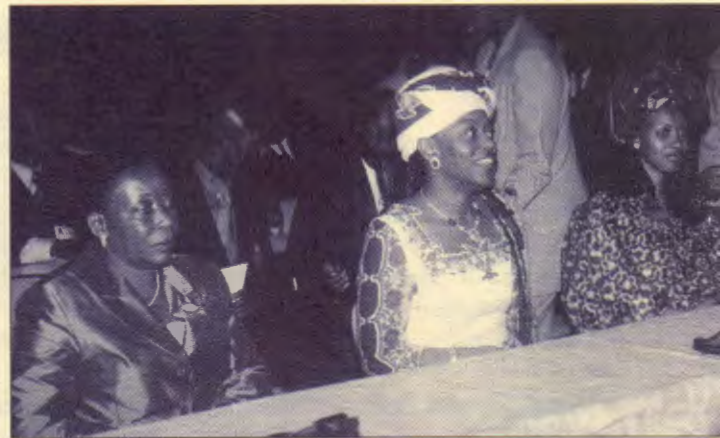
First Ladies follow proceedings.

Summit received a progress Report from the Council of Ministers on the implementation of the Review of the Operations of SADC institutions. These include the major tasks which have been completed, the tasks under implementation and the challenges being encoun-