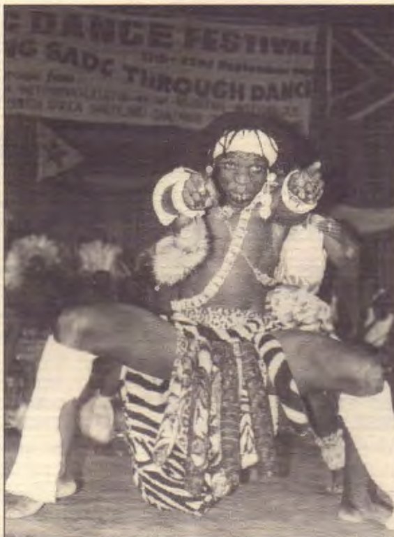
SADC's common identity is demonstrated by many cultural similarities among its member countries.

Through the document, SADC countries commit themselves to formulating and implementing policies that promote indigenous languages for national socio-economic development.