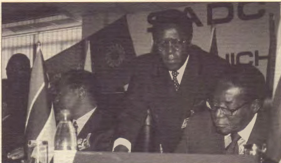
President Mugabe signs one of the SADC legal documents in Blantyre. Five protocols, a declaration and an agreement amending the SADC Treaty were signed by heads of state and government on 14 August.

Regarding food security, the SADC summit noted with "great concern" that the region faces a severe cereal shortage of 3.87 million tonnes.