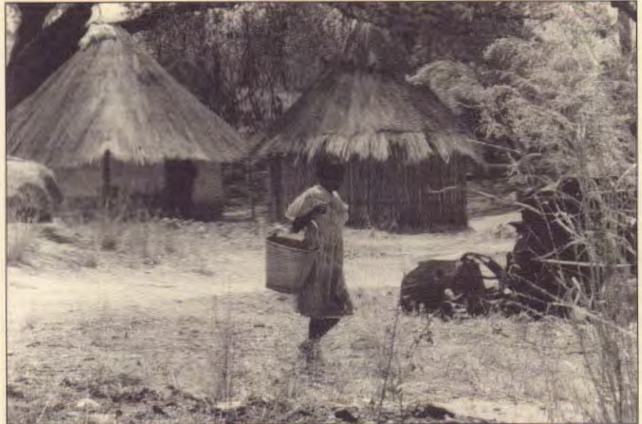
Multi-pronged strategy needed to fight rural and urban poverty.

Studies show that SADC requires an overall economic growth rate of at least six percent of GDP to begin to reverse poverty levels in the region. At the current annual average growth rate