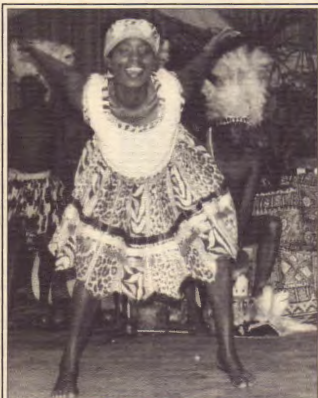
BUILDING SADC THROUGH CULTURE: More than 300 dancers from 10 SADC countries took part in an enthusiastic two-week dance festival in Harare from 13-22 September. See story, page 12.

SADC said the “key issue for Doha is to achieve a fundamental development agenda that will address the