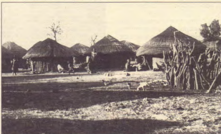
Long-running land issue: Ndebele kraal, 1898.

"It was noted that there is need for an equitable balance in addressing the land demands of the rural and urban poor on the one hand and the need to empower indigenous entrepreneurs on the other.