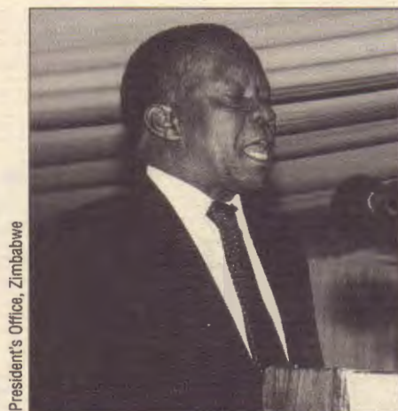
President's Office, Zimbabwe

"It is not an easy task to hatch a programme for the future of a country, and therefore we cannot be deceived that it will be an easy go. But certainly, the