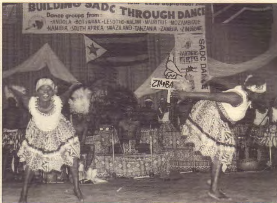
One of the many dance groups performing at the festival in Harare.

Zimbabwe's dance piece, a collection of colourful and dynamic choreography of traditional dances entitled "Celebrating Life" featured an orchestra of a wide spectrum of indigenous instruments – the drum, mbira (thumb piano), marimba and hosho (percussions), among others.