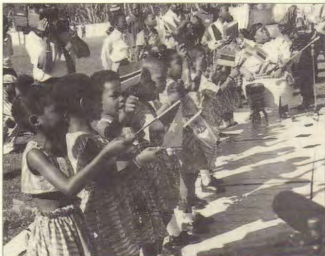
"Forum expects to have Citizens of SADC who are informed and can participate in driving regional integration efforts from bottom-up"

The Forum also expects to contribute to the advancement of the desires for peace building, economic prosperity, democratic governance and freedoms for citizens of the Community through their elected representatives.