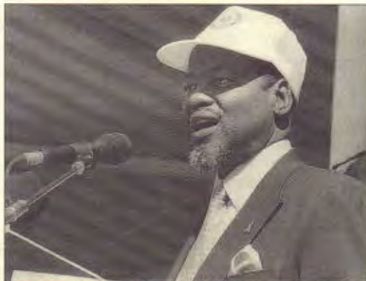
President Joaquim Chissano of Mozambique, new SADC chairman

for consolidating the vision of a viable continental community, capable of promoting common interests and lift Africa into the global mainstream of contemporary economic interaction.