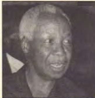
The late Mwalimu

A long memorial verse by his close friend and colleague, Dr Kenneth Kaunda, the former President of Zambia, reminds us all that, “The best way of mourning him is to carry on where he has left.” □