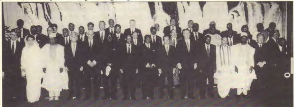
Commonwealth leaders last met in Africa in 1991, in Zimbabwe, when they adopted the Harare Commonwealth Declaration. Since then, they have met in Cyprus in 1993, New Zealand in 1995 and UK in 1997

CHOGM ends with a closing session and communique on 15 November. □