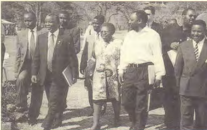
President Thabo Mbeki and his delegation on arrival at Victoria Falls for SAID '99

SAID'99 was unique in that it brought into the fold a fourth "smart partner" – the media. This also marked a reversal of roles – when