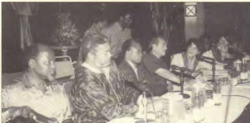
There was a reversal of roles at SAID '99 when heads of state and government quizzed the media on their role in development

But for the media, the way forward as watchdog of the society would be to continuously remind their fellow "smart partners" that "nothing is done until it is done." □