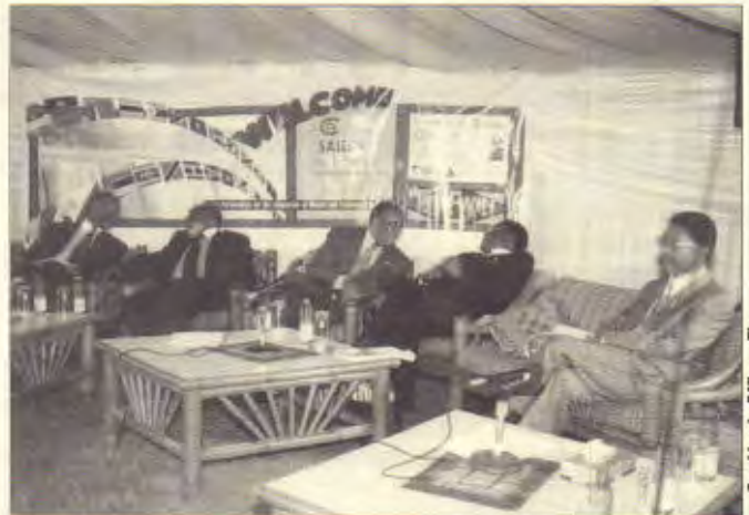
Some of the leaders who attended SAID '99 discuss the finer points of Smart Partnership

heads of state and government fired questions to media chiefs. In a no-holds-barred two-hour discussion, political leaders grilled journalists on whether they be-