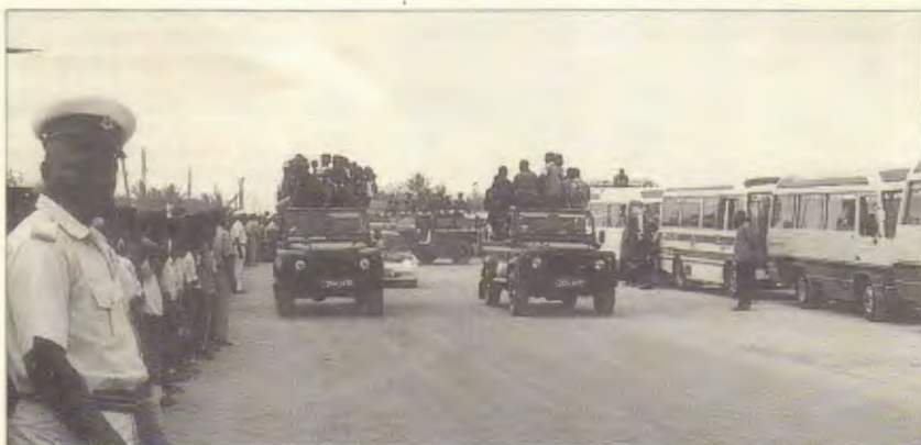
Part of the hundreds of thousands of mourners who lined up the streets of Dar es Salaam to pay their last respects to the former Tanzanian president Julius Kambarage Nyerere who passed away in a London hospital on 14 October 1999