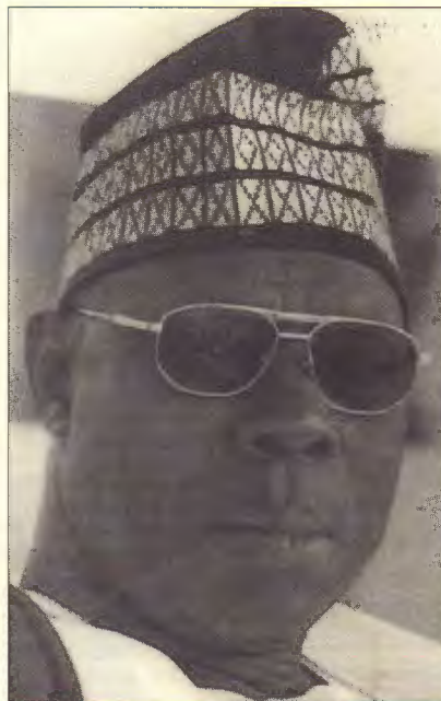
President Olusegun Obasanjo of Nigeria

"I therefore call on our two communities to explore, immediately, the prospects and possibilities of cooperation, both at the institutional level of the two secretariats and in enhanced bilateral interaction between the various member states, under an inter-regional framework." □