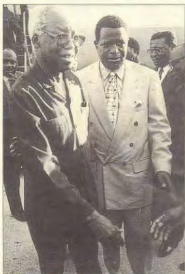
The late Nyerere with Keli Walubita Zambia's Foreign Affairs Minister during a visit to Lusaka

"Asante sana, Mwalimu . Thank-you, Mwalimu ." □