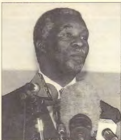
President Thabo Mbeki of South Africa, past SADC chairman

The call for a United States of Africa is not new. It is as old as the ideology of Pan-Africanism. The late Ghanaian leader Kwame Nkrumah, during his time, called for the creation of a continental