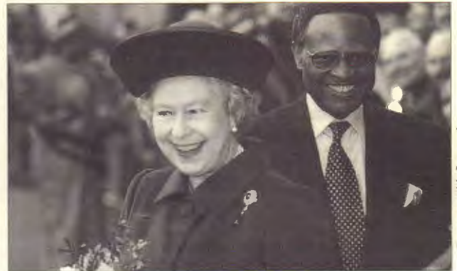
Her Majesty Queen Elizabeth II is Head of the Commonwealth, shown here with the Secretary-General, Chief Emeke Anyaoku from Nigeria. The Queen will visit Mozambique for the first time, just after the Durban summit on 15 November. Mozambique joined the Commonwealth in 1995.

Commonwealth leaders met previously in Lusaka, Zambia in 1979 in a historic summit that led directly to the successful Lancaster House negotiations on independence for Zimbabwe. They returned to southern Africa, to independent Zimbabwe, to meet in Harare in 1991, when the Harare Commonwealth Declaration set the association a new agenda for democracy, human rights and good governance.