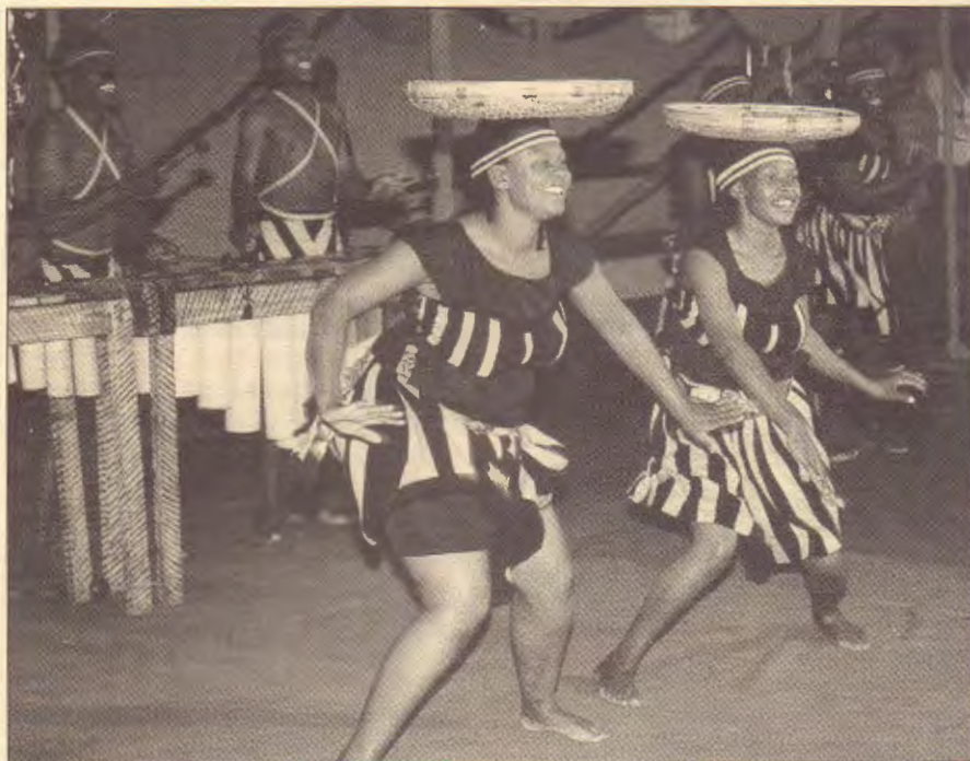
Min. of Information (Zimbabwe)