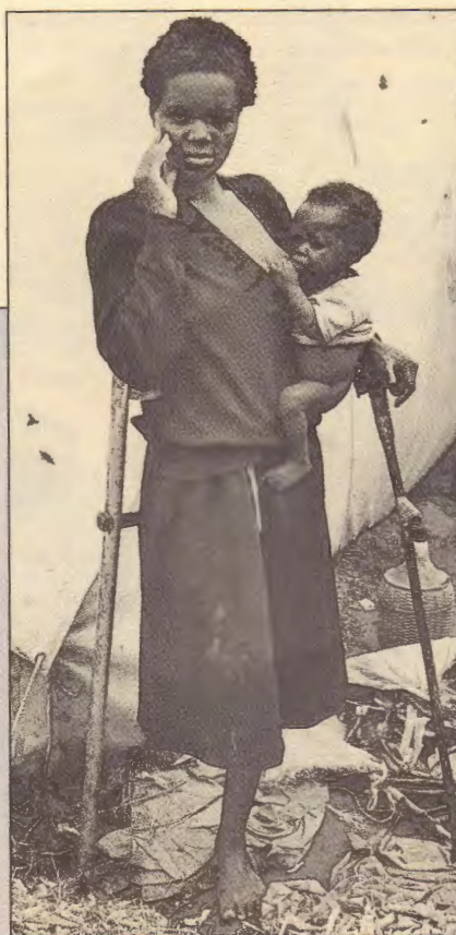
INNOCENT VICTIMS: lifelong pain

Angola has one of the highest rates of landmine injuries per capita in the world. □