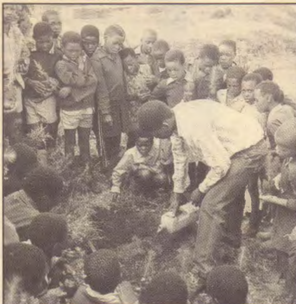
NATURAL RESOURCES: also for future generations.

Alleviating the poverty of the majority of the 140 million people in the region remains the overriding goal and priority.