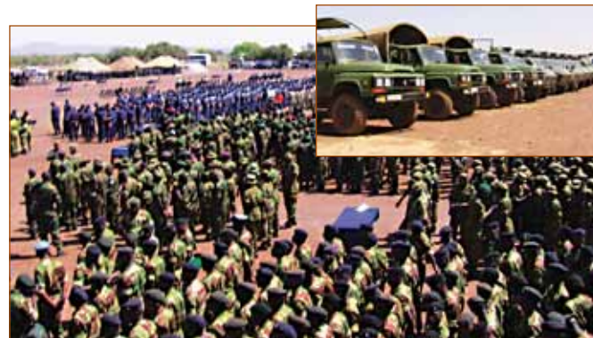
Exercise Golfinho is a valuable investment in the stability and security of the region and African continent at large.

Southern African leaders launched the force in August