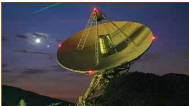
Accurate data such as that derived from Satellites is vital for planning.

South Africa is the only southern African country to launch a satellite into space. □