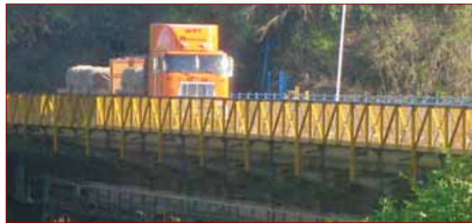
The Free Trade Area is expected to boost regional trade.

Meeting in Kinshasa, DRC for the annual SADC Summit in September, southern African leaders said while significant progress has been