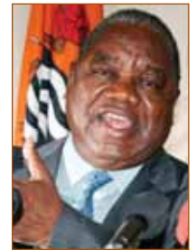
Part of the new SADC leadership elected; Presidents Kabila, Pohamba and Banda.

A NEW leadership for the next year was selected at the 29th Summit of SADC Heads of State and Government held in DRC in September.