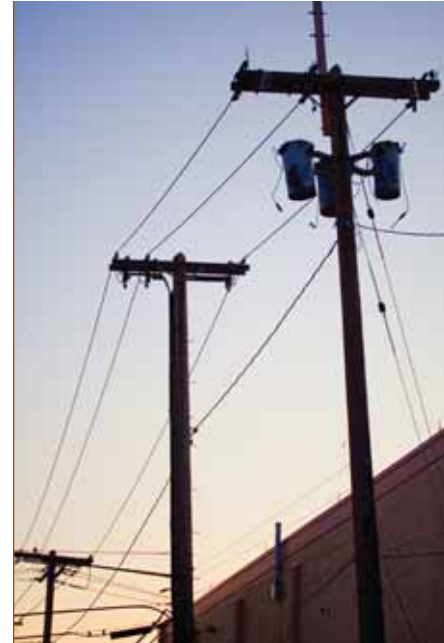
Improving telecommunication infrastructure remains a priority in the SADC region.

Another regional project is the e-SADC initiative that will help Member States to address the challenges of con-