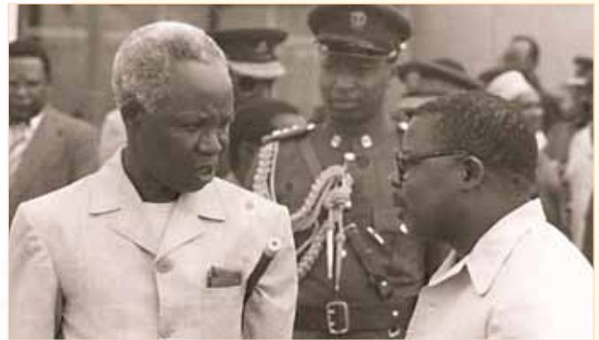
Mwalimu Julius Kambarage Nyerere with Benjamin Mkapa, who later became his President (1995-2005).