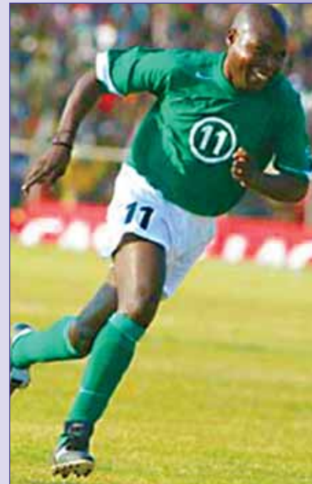
Kalusha Bwalya: one of the greatest soccer players to emerge from southern Africa.

Mozambique draws most of its power from the Cahora Bassa hydro station while the bulk of DRC's electricity comes from the Inga plant. □