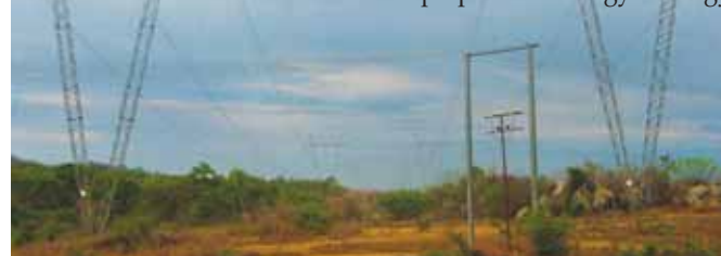
Transmission lines are key for cross border power trade.

The leaders also made a commitment towards enhancing support in order to contribute to industrial growth, the development of energy infrastructure, the exchange and transfer of technologies, the reduction of transaction costs and the enhancement of human skills to ensure the