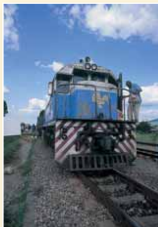
Tazara was built in the 1970's

He cited the TAZARA railway line that was built by China in the 1970s as a good example of regional integration. The railway line was built to carry Zambian com-