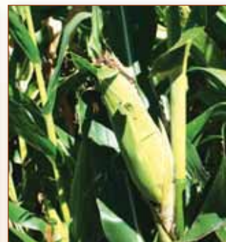
Some of SADC staple foods : sorghum, barley and maize

hectares of planted crops in the resettlement areas.