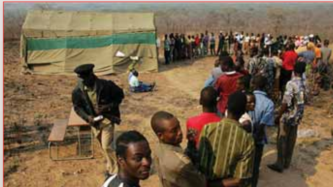
People queuing to vote in the last general elections in Zambia

Municipal elections due to take place on 20 December 2010 were also postponed on "organisational grounds" with no new date fixed. Whether the presidential election on 4 May will be affected is not yet clear.