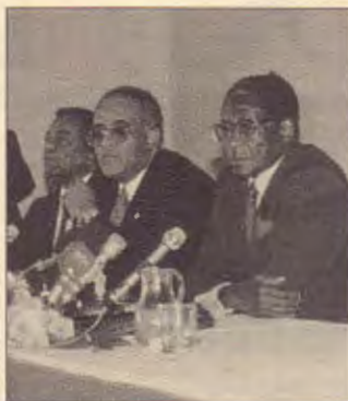
OAU Summit 1