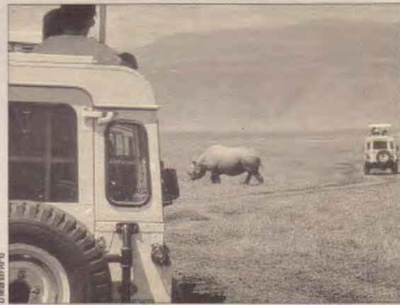
WILDLIFE: one of the region's major tourist attractions

"However, southern Africa is still a very small player with only one percent