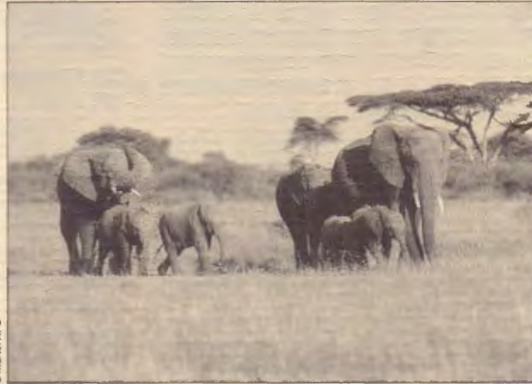
Elephants at Ndotu near Serengeti National Park, Tanzania

going back home excited, practical conservation news," pointing out that it is the only possible way that "our people can benefit from welfare and our conservation."