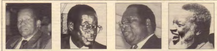
PATRONS OF THE SMART PARTNERSHIP: Masire, Mugabe, Muluzi, Nujoma

The Smart Partnership concept underlines a complimentary and mutually