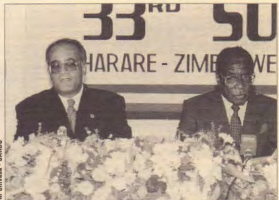
New OAU Chairman, President Mugabe, Secretary General, Salim Salim (left)

But the new chairman of the OAU, President Mugabe was not shy to speak out against military leaders and pointed