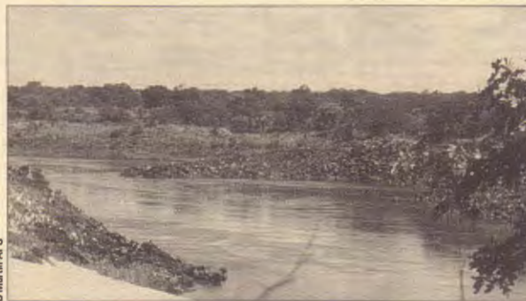
Zambezi river in western Zambia: shared by eight SADC countries

Water experts have warned that freshwater will be a strong weapon as populations increase in the face of scarce water resources.