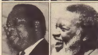
Smart Partnership 4